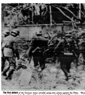
The first picture of the German Army actually going into action against the Poles. These are in the area of the Free City of Danzig, closing in on the Polish-held Westerplatte peninsula. The man in the foreground carries a range-finder shung across his back. At the left is an

1. Probably the first press photo of the Second World War. It originated with the Associated Press, the Third Reich's most loyal media partner.