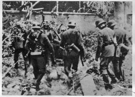
2. A photograph in a Nazi newspaper attributed to the Associated Press

The comparison in pic. 3 shows how Nazi informational photographs from Poland in September 1939 promptly reached both American and British press outlets, and thus the public opinion of the Reich's military opponents. The Nazis wanted it that way in order to control the global coverage of the invasion of Poland. The bulk of the photographs produced by German propaganda<sup>5</sup> was circulated by the Ap's transatlantic network, a development considered a huge success of Goebbels and his Ministry. On 18 September 1939, "Time Magazine" (p. 26) praised Nazi propaganda – even if with a tinge of cynicism – while at the same time sharply criticizing the PR of the Allies, i.e. the UK and France.