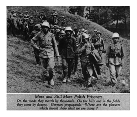
3. Photographs depicting the invasion of Poland in September 1939, published in different periodicals. The closeness of their publication dates testifies to the skillful exchange of press photos between Nazi Germany and the UK and USA in September 1939.

"Time" viewed the Reich's propaganda as successful, while specific mistakes were pointed out to the Allies (pic. 4):